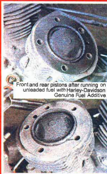
Front and rear pistons after running on unleaded fuel with Harley-Davidson Genuine Fuel Additive

With Harley-Davidson Genuine Fuel Additive added to unleaded fuel, combustion chamber deposit is prevented from forming, and previously formed deposit is reduced.